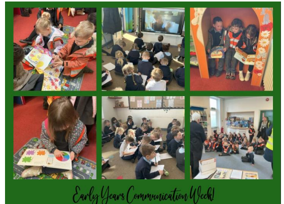
Early Years Communication Week!